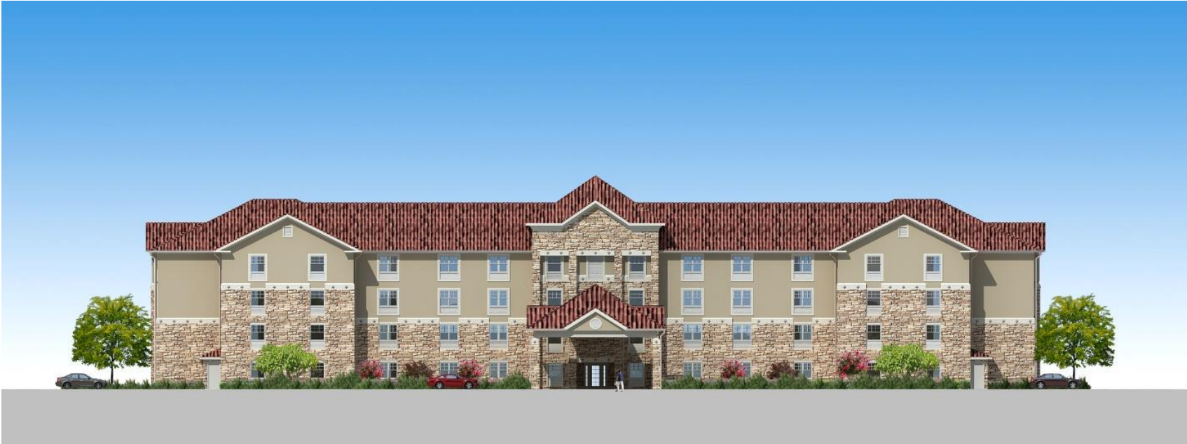
Mainstay Hotel – McKinney, TX