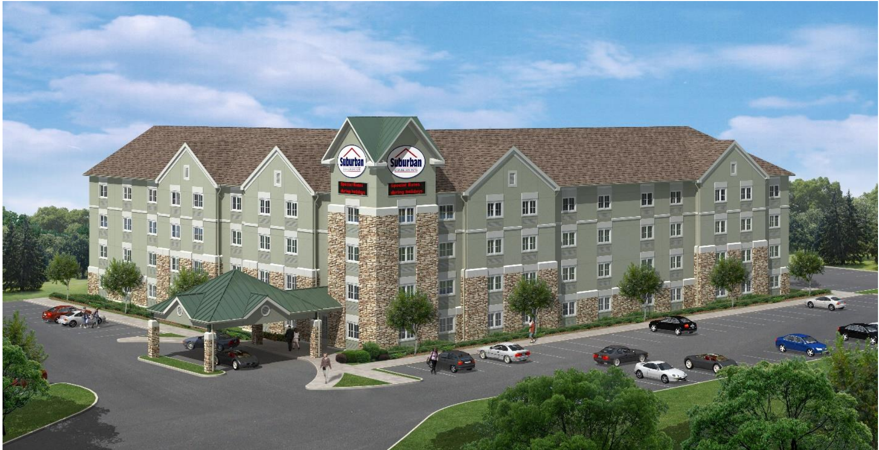
Suburban Hotel – Tulsa, Oklahoma