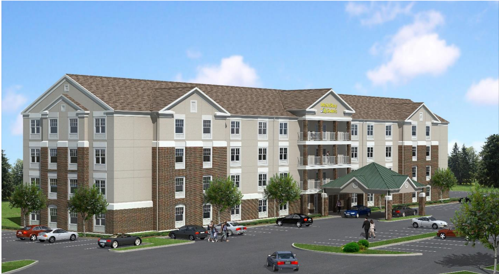
Mainstay Hotel - Tulsa, Oklahoma