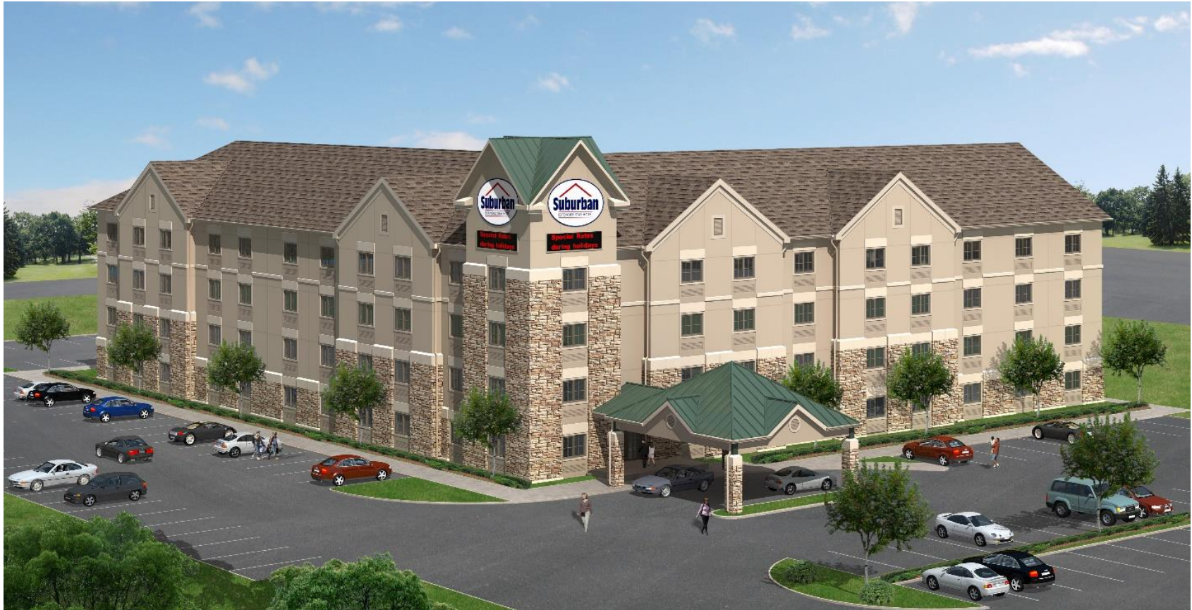
Suburban Hotel - Colorado Springs